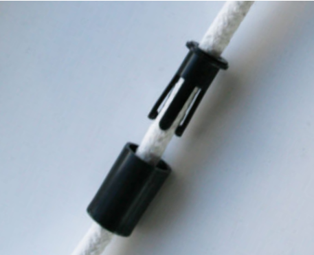
Close up of the brake itself unengaged and free to move