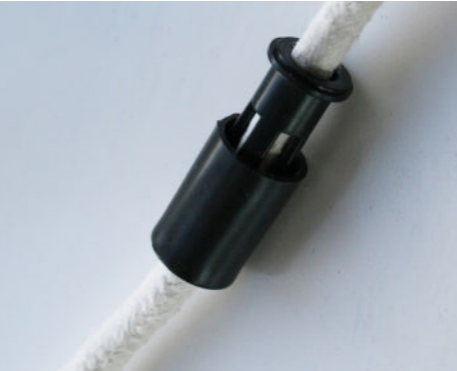
Close up of brake in it's engaged state

Is discreetly mounted in the side of the sash, allowing safe and easy removal of both the upper and lower sashes, to therefore give free access to the window box frame, and is not visible either internally or externally during the normal operation of the sash window.