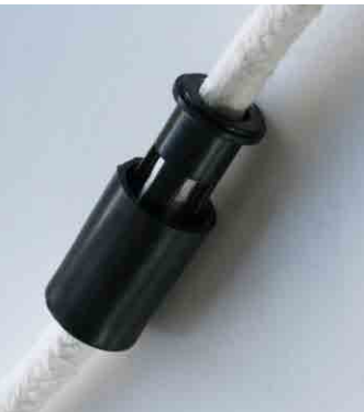
Close up of brake in it's engaged state