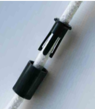
Close up of the brake itself unengaged and free to move

Sash Removal System (SRS) is discreetly mounted in the side of the sash, allowing safe and easy removal of both the upper and lower sashes, to therefore give free access to the window box frame, and is not visible either internally or externally during the normal operation of the sash window.