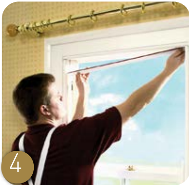
4 Remove the parting bead (C) that spans the top width of the window.