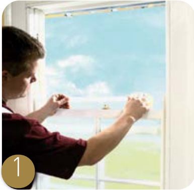
1 Using one inch masking tape, protect the Weatherfin Pile at the midrail (H) and bottom rail (J) of the bottom sash (F).