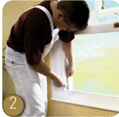
2 Slide the bottom sash (F) up and ease out the lower two parting beads (C) from either side of the frame.