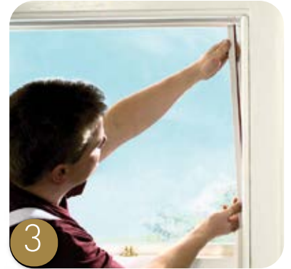
3 Pull down the top sash (E) remove the two upper parting beads (C) from either side of the frame.