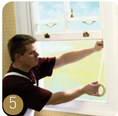
5 The sashes will now move more freely with the parting beads removed. Using the masking tape, protect the Weatherfin Pile in the staff beads (I).