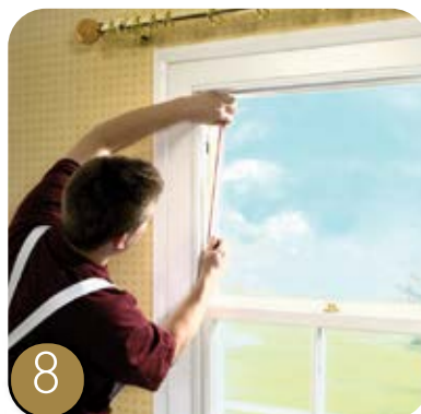
8 Replace the upper three parting beads - two either side and one spanning the top width of the window (G).

You may need to gently use a chisel to remove the partings beads from around the sash