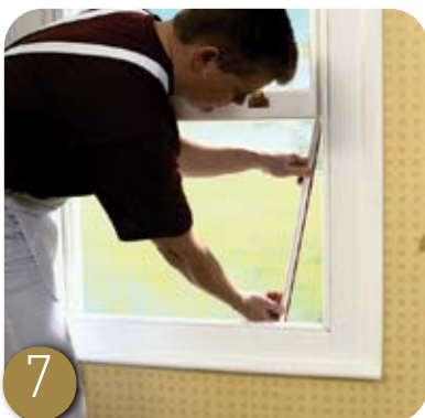
7 Once painted, remove the masking tape from the staff beads (I), the midrail (H) and bottom rail (J) of the bottom sash and replace the two lower parting beads.