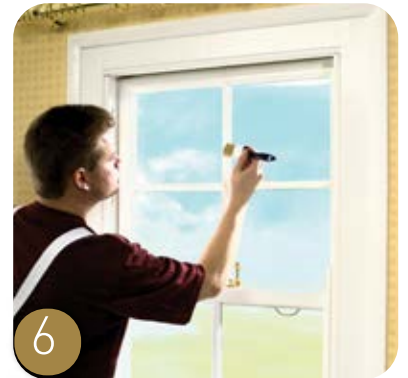
6 Paint the windows as normal, ensuring the sashes are moved slightly every hour to avoid sticking. For painting tips see overleaf.